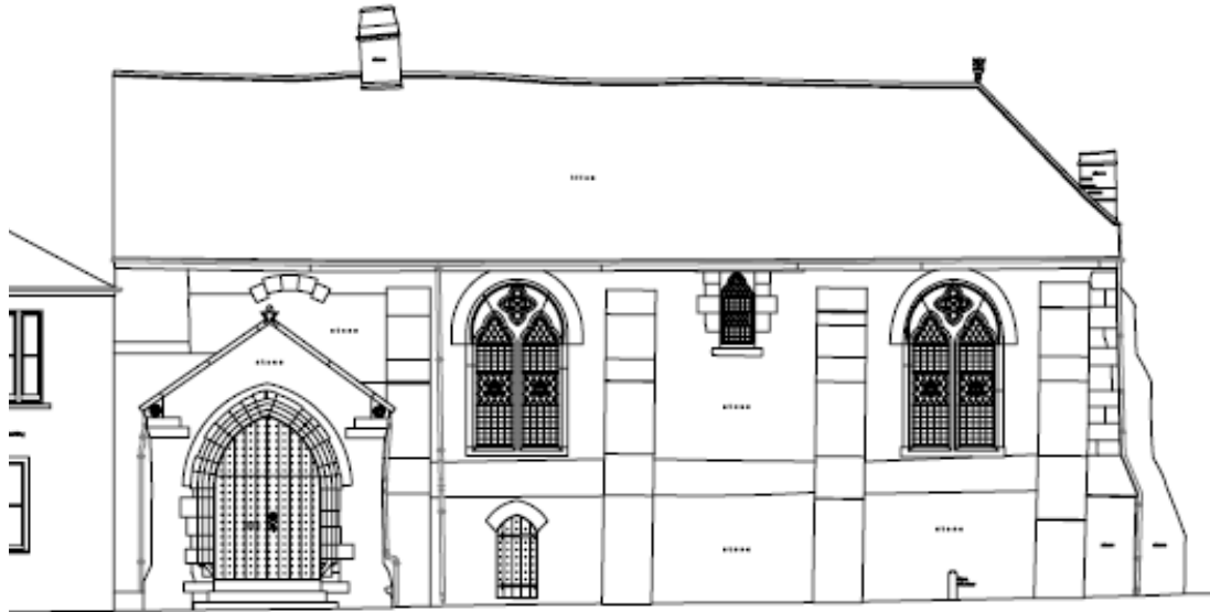
Existing elevation and section supplied by Purcell Miller Tritton Architects